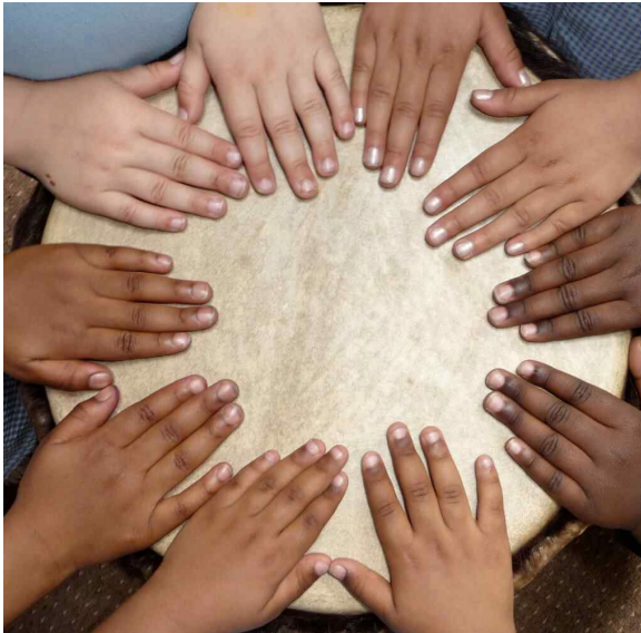
Community Engagement and Development