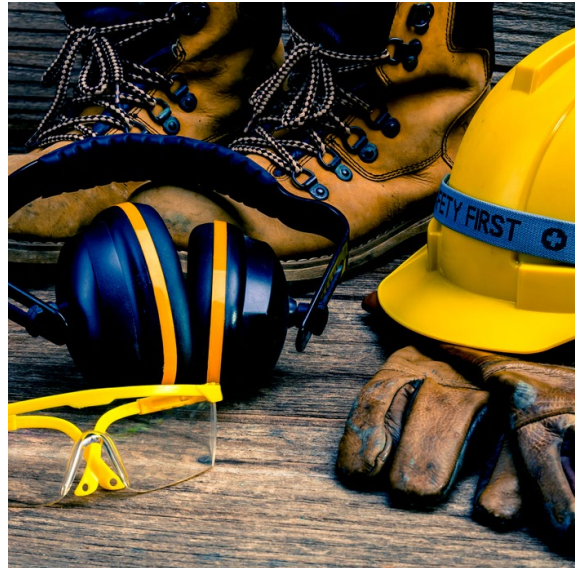
Workforce Health & Safety