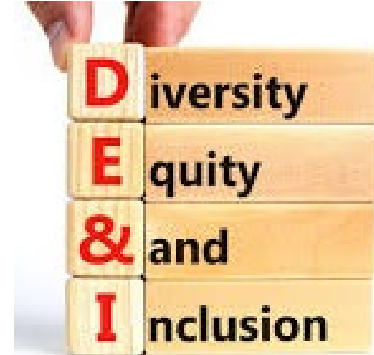
Diversity, Equity & Inclusion